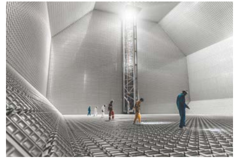
GTT's unique MKIII membrane